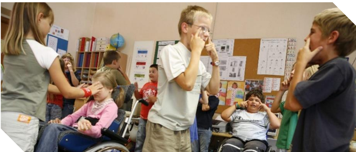
Inclusive classroom in Graz, Austria (2015).

Addressing the inclusion of marginalised learners must be the core of education reform for inclusion. It is the only way to build quality, equitable, inclusive education systems for all learners. Because patchy efforts that focus on this or that group and attempts to overcome this or that obstacle have not been successful, overcoming the learning crisis – by creating an inclusive education system for all – requires that all stakeholders come together and work with one vision to achieve one goal. History has demonstrated that if education systems do not improve overall, they will not improve for children and youth with disabilities.