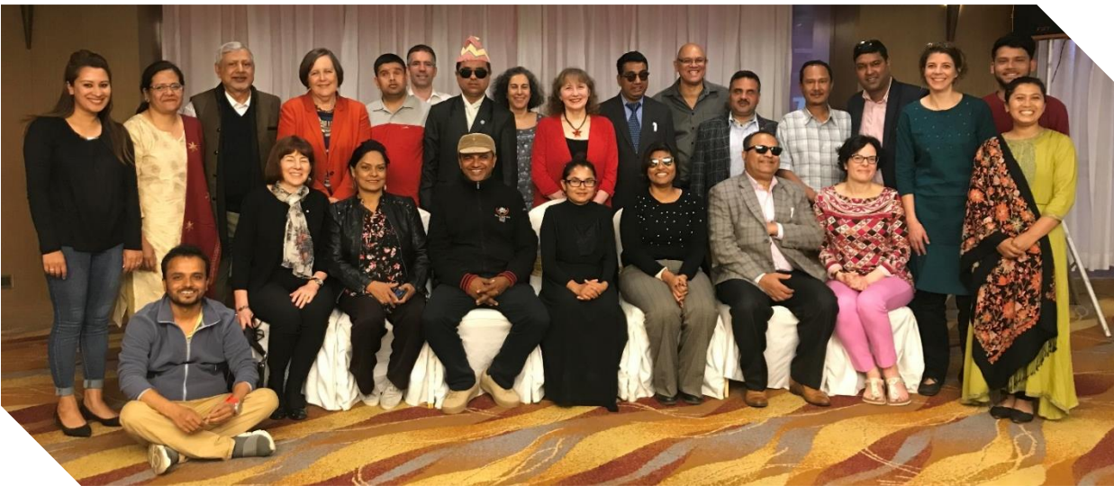
Members of the IDA Inclusive Education Task Team with representatives of Nepalese OPDs in Kathmandu. March 2019.